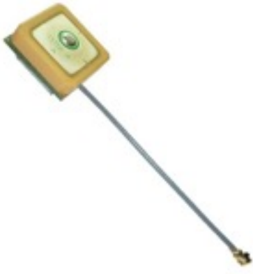
Dimension (Unit: mm)